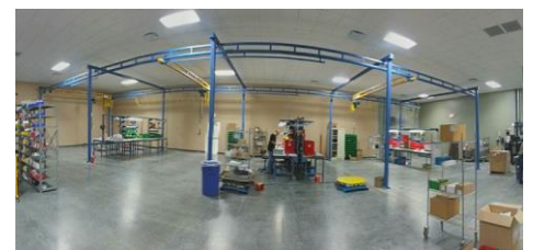
Elite Controls Lab