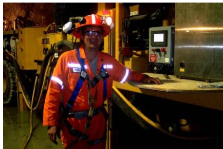
Underground Mining Application

EOHI is a 100% employee owned company based in Houston, TX with offices in Oklahoma, Louisiana, Florida, Colorado, Arizona & New Mexico.